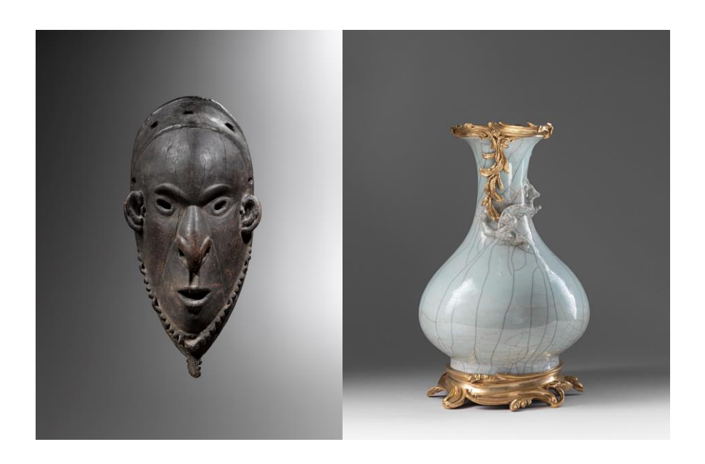
Serge Schoffel: Mask, Lake Murik area, Papua New Guinea, 19th century (1) – Jean Lemaire: celadon porcelain vase from China, circa 1740 (2)

Costermans, found a buyer for his centrepiece; a rare vase in celadon porcelain from China (early Qianlong, circa 1740) with a gilt bronze mount (France, circa 1750-1755).