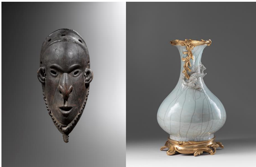
Serge Schoffel: Mask, Lake Murik area, Papua New Guinea, 19th century (1) – Jean Lemaire: celadon porcelain vase from China, circa 1740 (2)

Costermans, found a buyer for his centrepiece; a rare vase in celadon porcelain from China (early Qianlong, circa 1740) with a gilt bronze mount (France, circa 1750-1755).