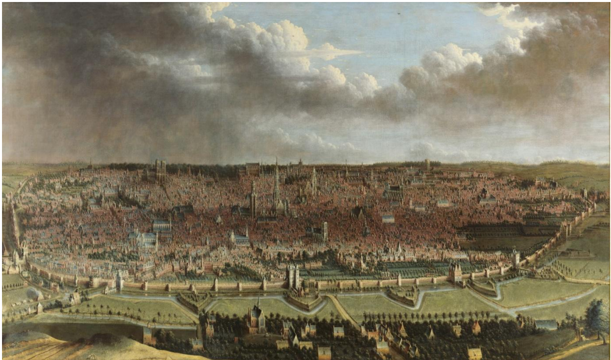
Jean-Baptiste Bonnecroy, View of Brussels , 1664–1665.