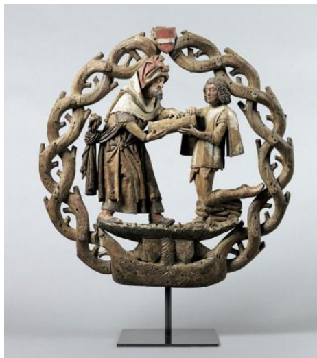
Bruges workshop, The Holy Blood ensign , 1529.