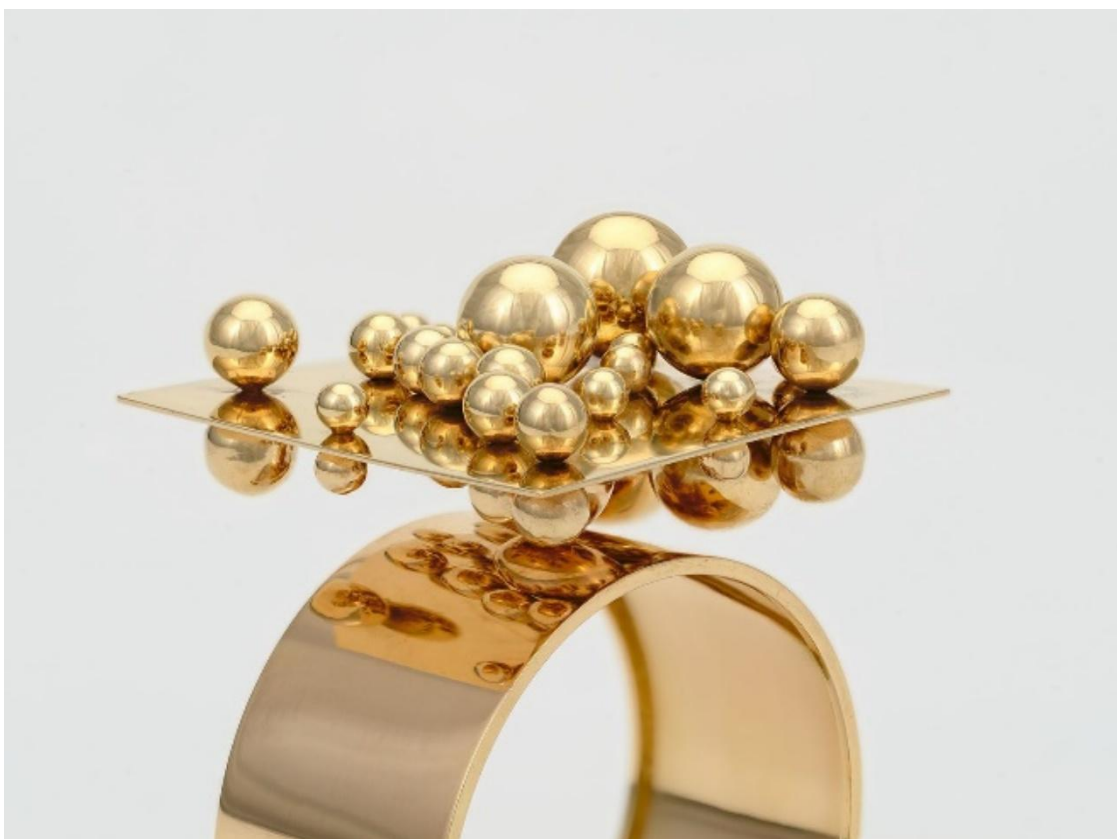
Pol Bury, Bracelet Boules des deux côtes d'un carré , 1968.