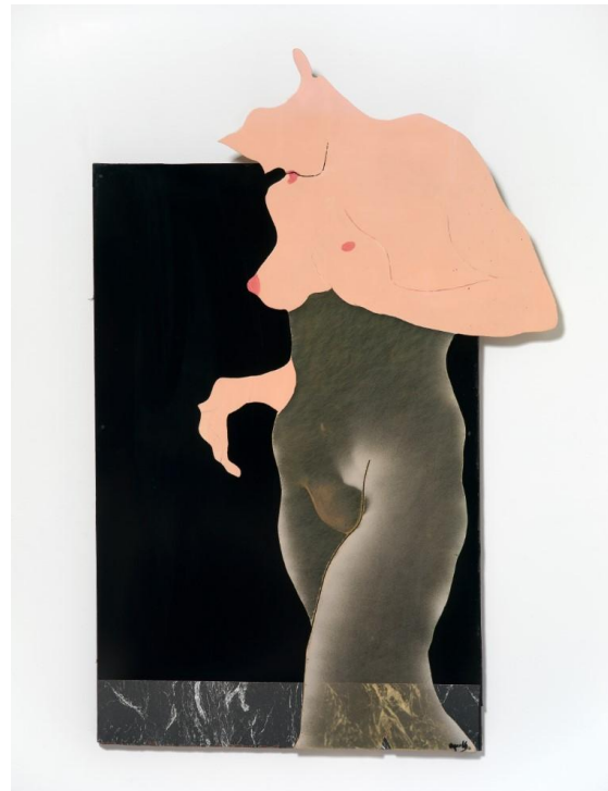
Evelyne Axell, L'égocentrique 2 , 1968.