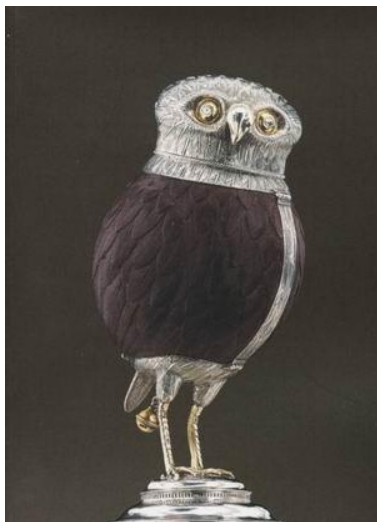
Owl hallmarked Antwerp, 1548-1549.

Two reasons to celebrate for the King Baudouin Foundation: the Foundation is not only turning fifty in 2026, but was also invited to be the guest of honour at the 71st edition of the prestigious BRAFA art fair. A remarkable accolade for the King Baudouin Foundation and its philanthropists, who have been dedicated to preserving Belgium's heritage for decades, and the crowning glory of the Foundation's long-term partnership with BRAFA.