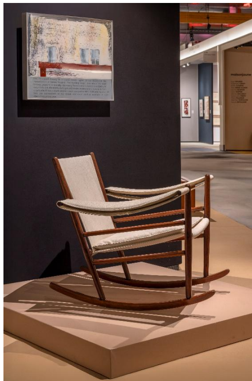
BRAFA 2026 – Galeria Bessa Pereira

In the Design section, Galeria Bessa Pereira attracted a diverse clientele, including Portuguese and Belgian collectors as well as private clients, confirming the growing interest in design at the Fair. robertaebasta sold its remarkable cocoon chair by Louis Vuitton, ed. 8/8, for a price between €50,000 and 60,000.