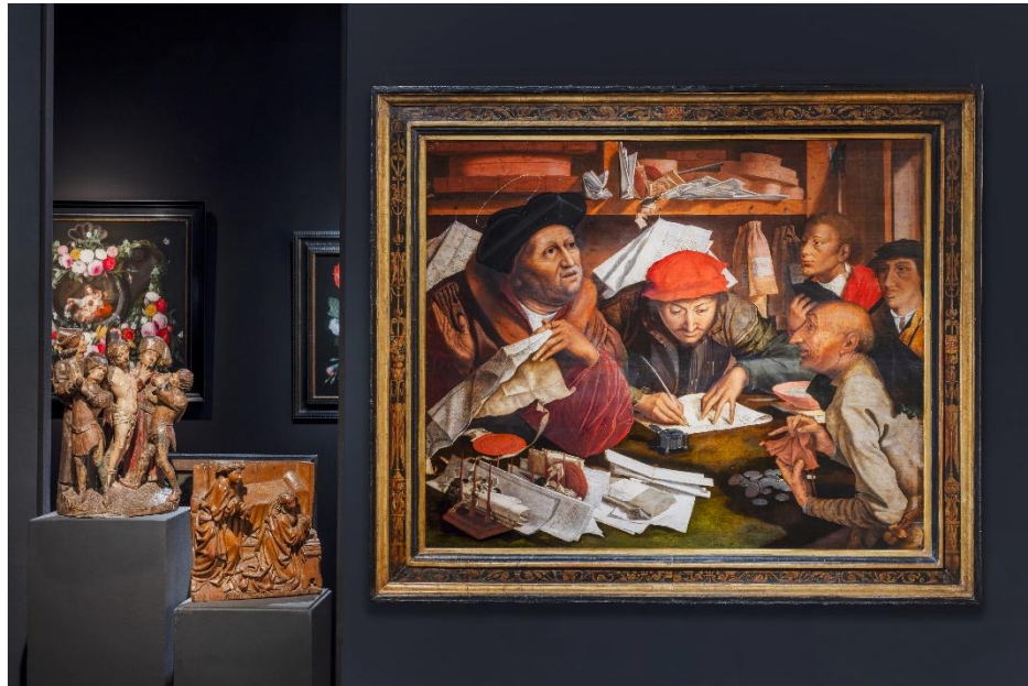
BRAFA 2026 – Jan Muller Antiques

Arnaud Costermans sold a remarkable view of Venice by Apollonio Domenichini, better known as the master of the Langmatt Foundation, for approximately €80.000.