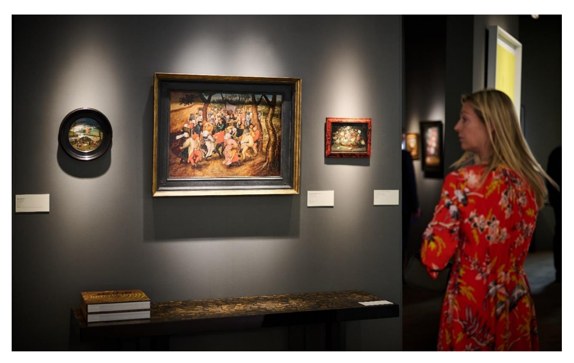
BRAFA Art Fair 2022 - De Jonckheere

BRAFA will be the first major European art fair to visit in 2023, positioning it, as per tradition, as a true barometer of the art market. The 68th edition of BRAFA will take place from Sunday, January 29<sup>th</sup> to Sunday, February 5<sup>th</sup> at Brussels Expo at the Heysel in Halls 3 and 4, where 130 exhibitors will be taking over the entire space. This venue, the new setting for BRAFA since June, was greatly appreciated by its visitors at the last event, both for the openness of its aisles and for the very pleasant atmosphere that reigned there.