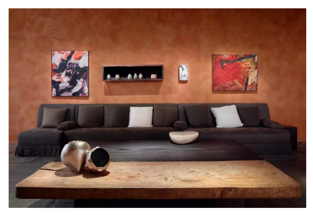
BRAFA 2022 - Axel Vervoordt

VKD Jewels – NEW 2023 (NL) Zidoun-Bossuyt (LU/UEA)