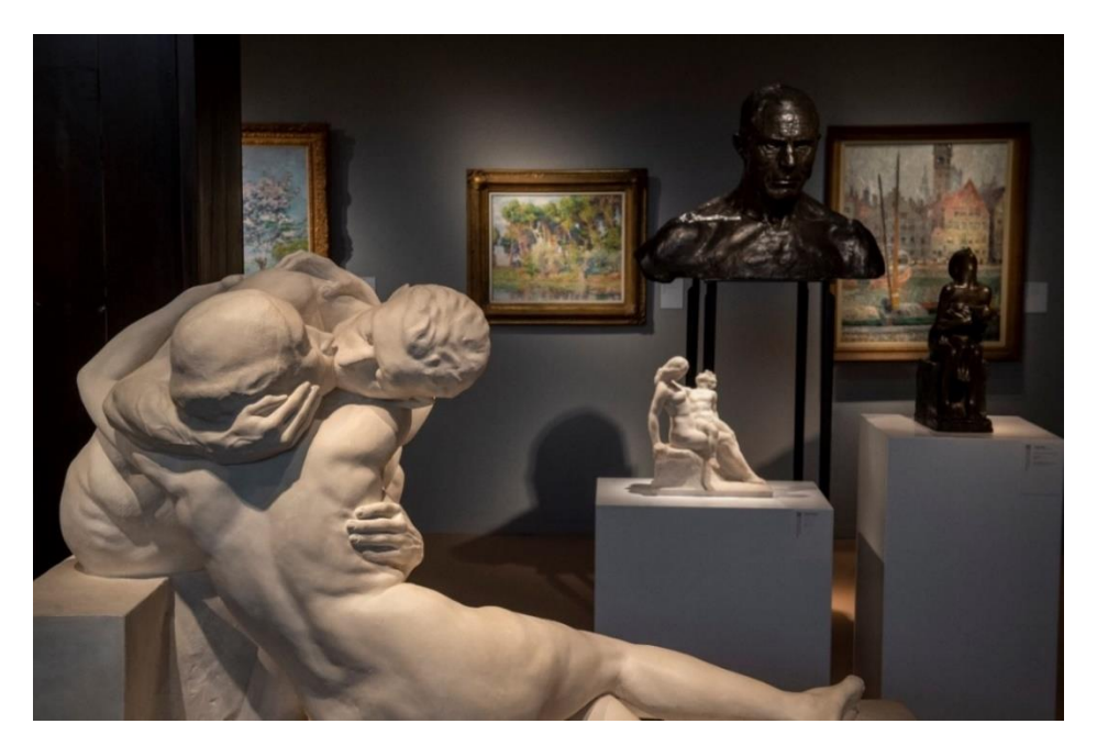
BRAFA Art Fair 2022 - Francis Maere Fine Arts