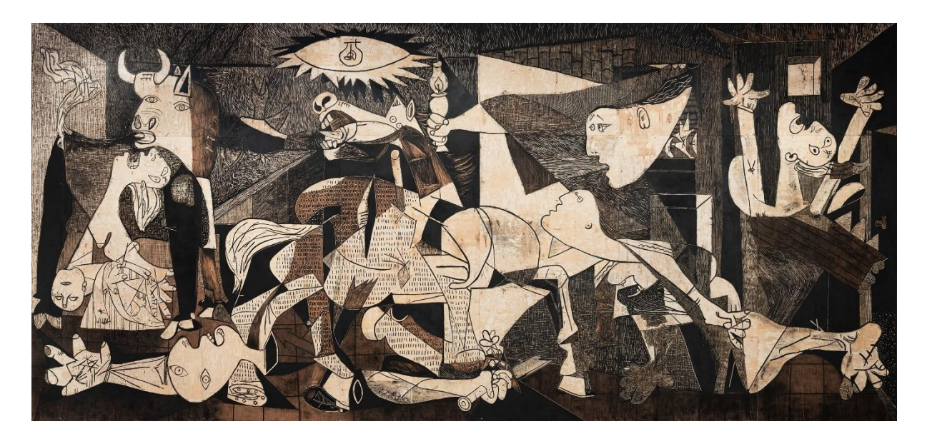
Nosbaum Reding: Damien Deroubaix (Lille, 1972), Garage days re-re-visited , 2019. Engraved wood and ink 243 x 776 x 1 cm. Unique piece

A must-see at BRAFA : Stand 76 of Morentz gallery (NL) which is articulated on either side of a red spiral staircase by Georges Ferran, made for Axe, in polyester foam, steel and lacquer, France, 1971.