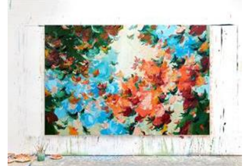
Arne Quinze, \textit{Erysimum} - \textit{Zinnia\_Luminosa} \ @ Maruani Mercier \