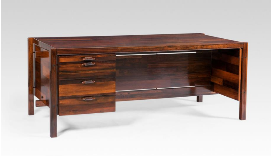
Jorge Zalszupin, 'Ambassador' desk, 1962