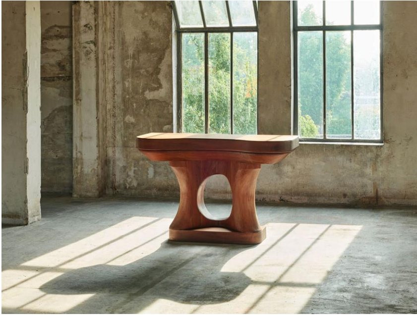
José Zanine Caldas, hand-carved 'console', circa 1970s.