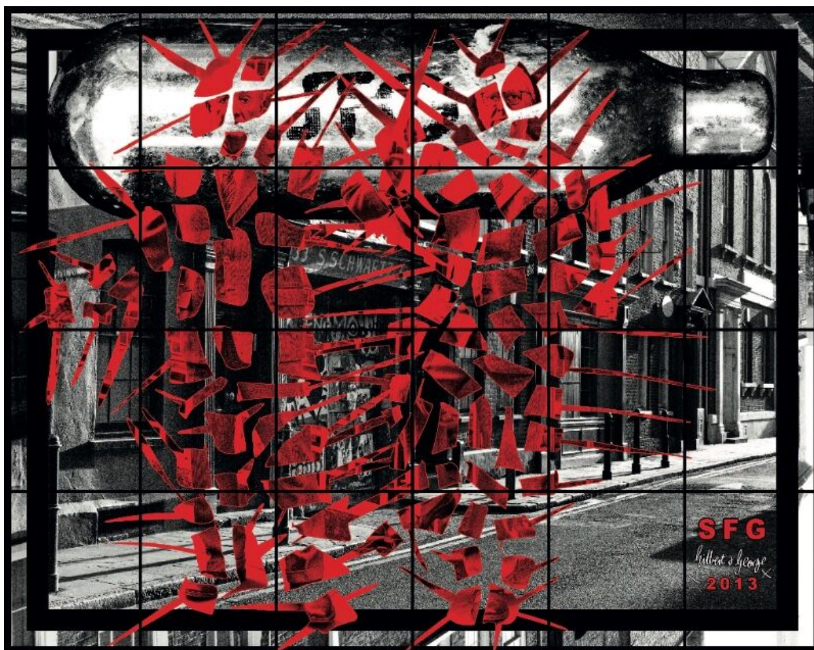
SFG. 2013. 302 x 381 cm