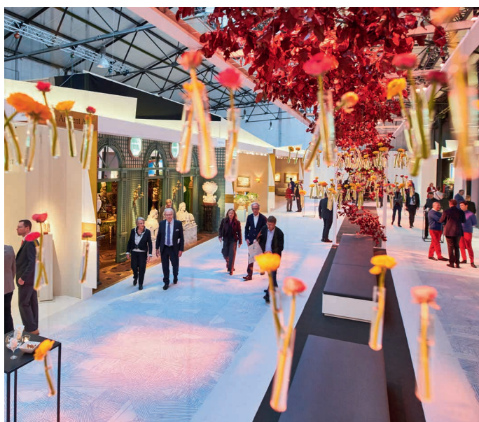
BRAFA 2019

Foire des Antiquaires de Belgique asbl Antiekbeurs van België vzw Tour & Taxis - Royal Depot Avenue du Port / Havenlaan 86C Box 2A BE-1000 Brussels t. +32 (0)2 513 48 31 info@brafa.be - www.brafa.art