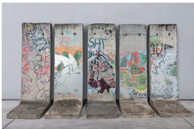
Segments of the Berlin Wall