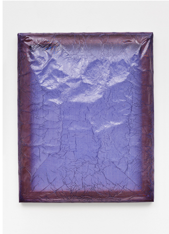
EDITH DEKYNDT Winter Drums 11 , 2017 Fabric, resin, wooden frame. 50 x 40 cm.