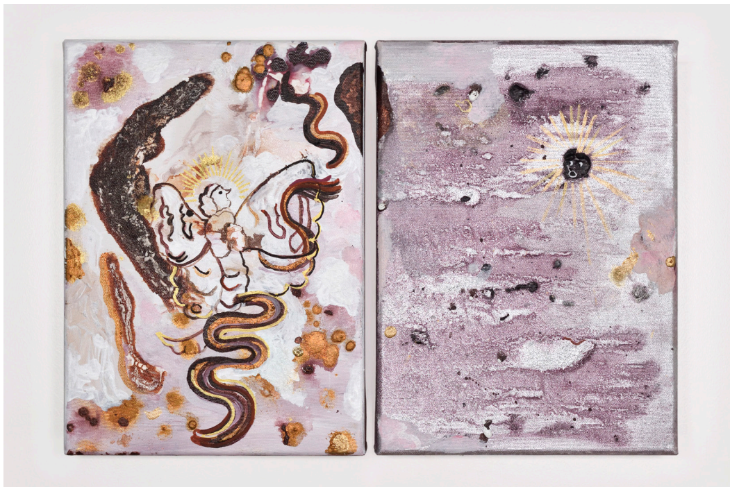
HÉLÈNE DELPRAT TODAY XV , 2024 Diptych. Pigment, acrylic binder and glitter on canvas. 33 x 24 x 4 cm (each).