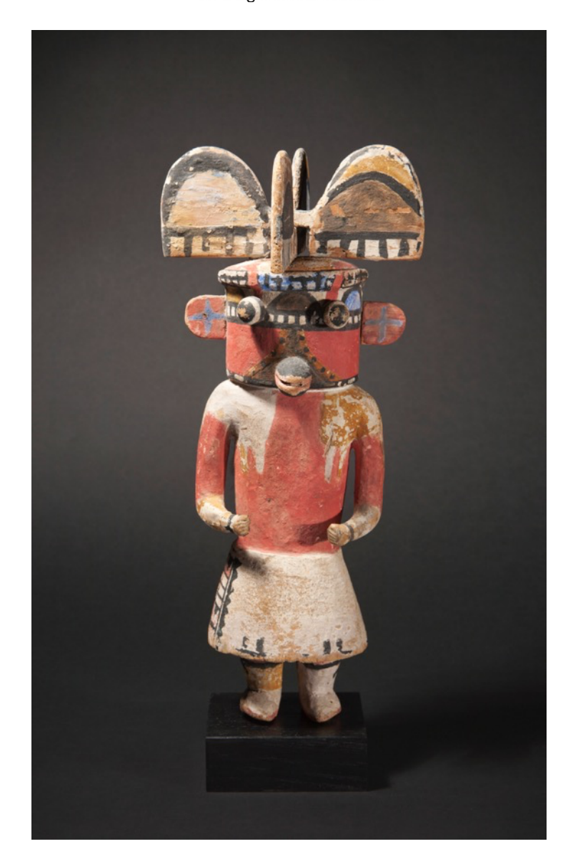
Cross Crown, Four-Corner Cloud Nahoile-chiwakopachoki Katsina doll Hopi, Arizona Carved cottonwood, natural pigments Circa 1910s or earlier Height: 32 cm

8 rue des Beaux-Arts, 75006 Paris T: +331 46337777 – contact@galerieflak.com www.galerieflak.com