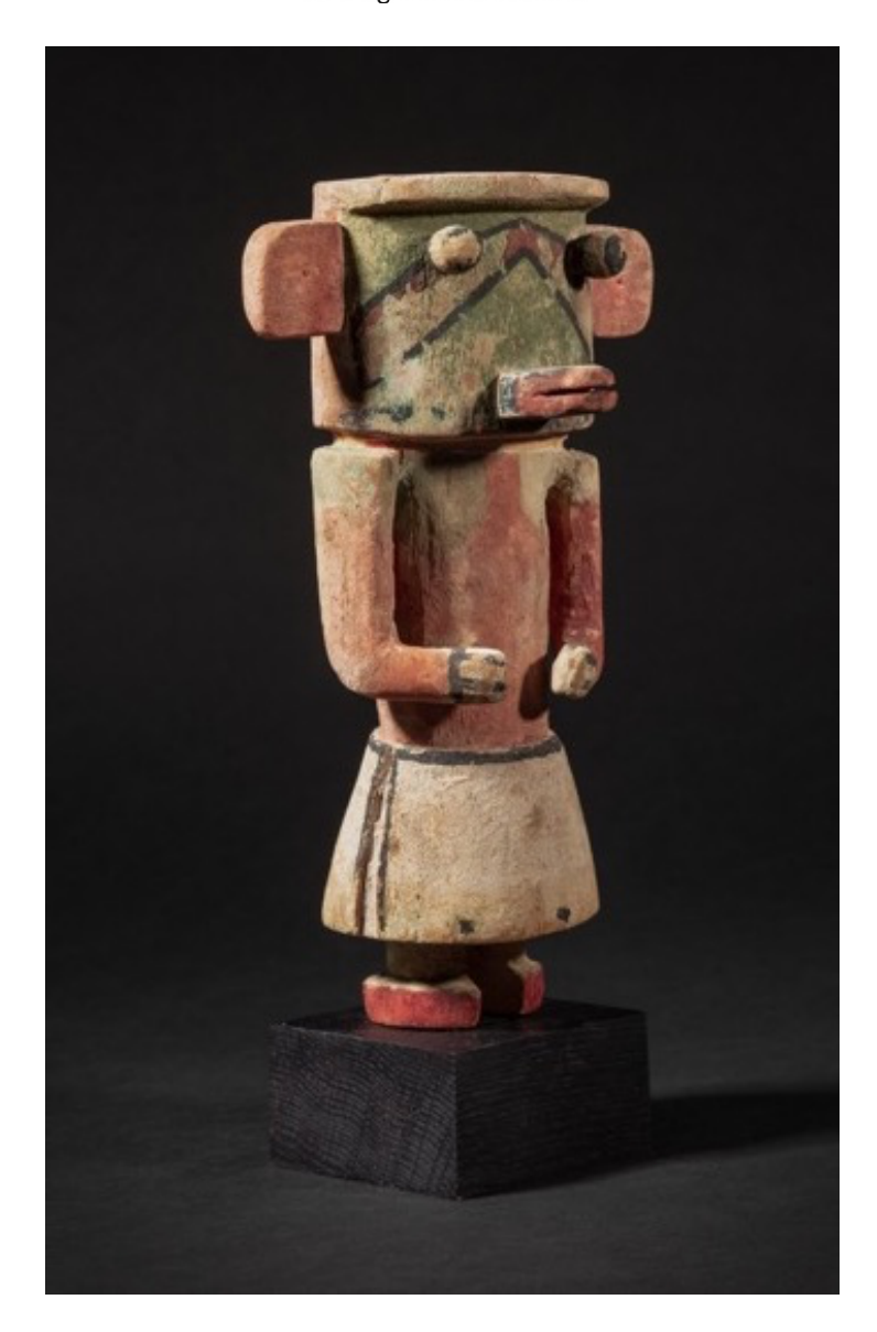
Eagle or Red-Hawk Falcon Kwahu / Palakwayo Katsina doll

8 rue des Beaux-Arts, 75006 Paris T: +331 46 33 77 77 – contact@galerieflak.com www.galerieflak.com