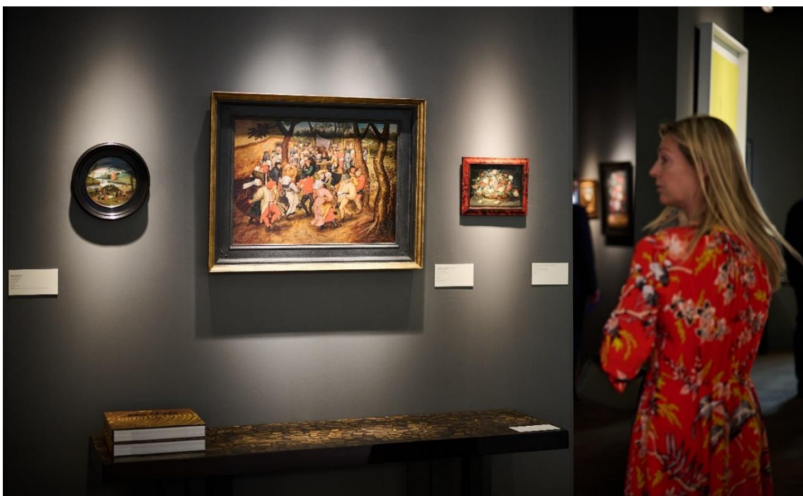
BRAFA Art Fair 2022 - De Jonckheere

BRAFA 2023: BRAFA is returning to its January dates in the calendar of international art fairs