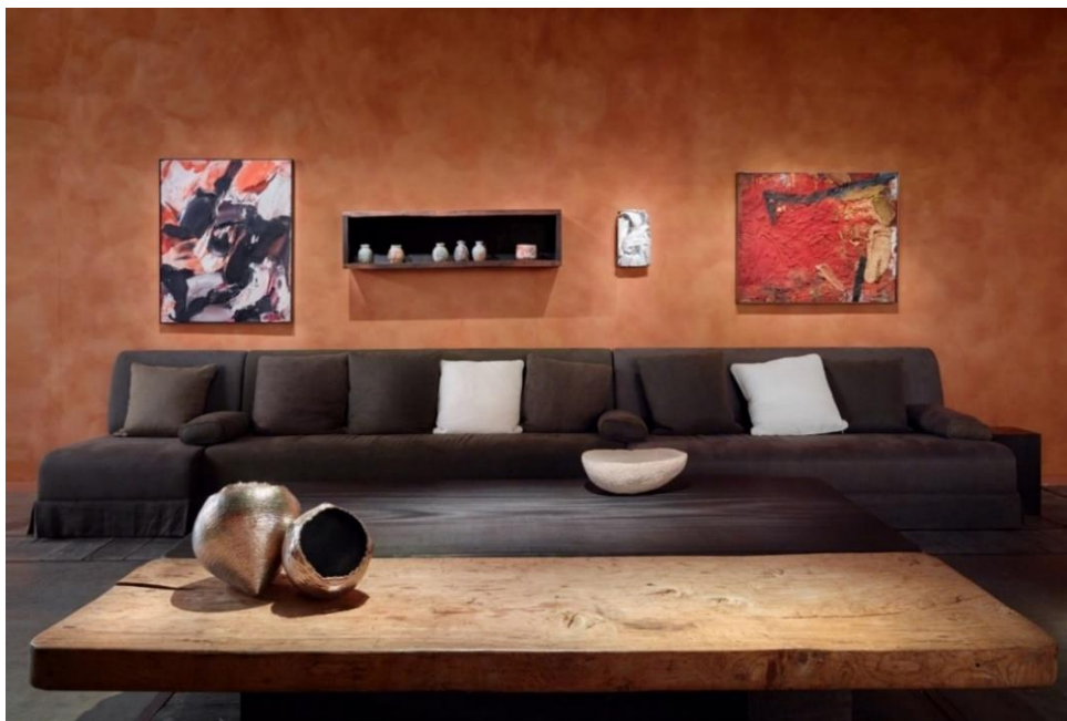
BRAFA 2022 - Axel Vervoordt