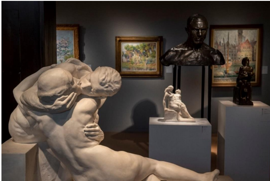
BRAFA Art Fair 2022 - Francis Maere Fine Arts