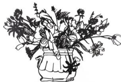
Wildflower Bouquet, 1988 Enamel paint on laser-cut steel 147,3 x 147,3 cm