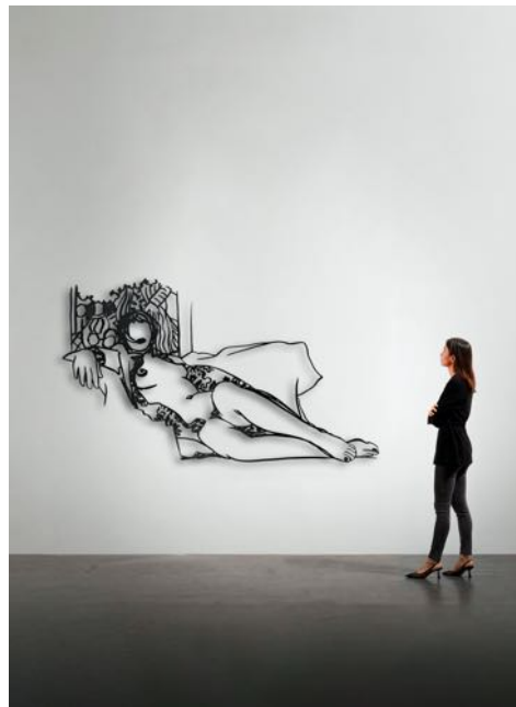
Monica Nude with Matisse, 1987 Enamel paint on laser-cut steel 128 x 218 cm

The auction record for a work by Tom Wesselmann is $10.7 million, dating back to 2008. It goes without saying that the price range of the works exhibited at the Brafa Fair is considerably lower, ranging from 50,000 to 750,000 euros, but it is plausible that Wesselmann could be one of the rediscoveries in the coming years.