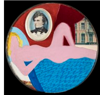
Little Great American Nude #1, 1962, Paint, plastic portrait, printed reproductions, fabric with pencil on metal plate, 17,8 cm

Tom Wesselmann's first works date from the late 1950s and early 1960s and were primarily collages made from wallpaper and advertisements, sometimes combined with painted nudes in American interiors. These works are extremely rare and are mostly found in museum collections around the world. Two small works of this kind will be shown at Brafa.