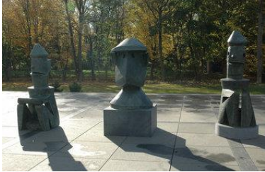
Max Ernst Corps enseignant pour une école de tueurs, Ex. 8/8 1967 / 2002 ff. Bronze · Bronze 12 Exemplare: 1/8 – 8/8 + AP 1/4 - AP 4/4 12 Casts 1/8 – 8/8 + AP 1/4 - AP 4/4