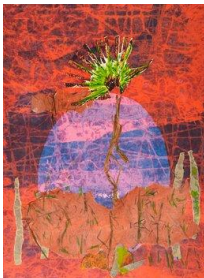
Amy Ernst Votive Dance II 2022 Collage und Monotypie auf Papier · Collage and monotype on paper 76,2 x 55,9 cm Signiert unten rechts 'Amy Ernst' · Signed lower right 'Amy Ernst'