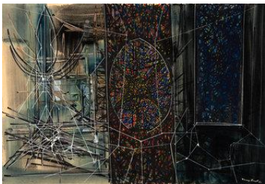
Jimmy Ernst Untitled 1962 Gouache auf Vélín · Gouache on wove paper 31,5 x 45,5 cm Signiert und datiert unten rechts · Signed and dated lower right