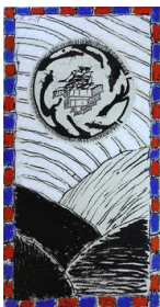
Pierre Alechinsky Sauve qui peut ! II 2016 Acryl und Radierung auf handgeschöpftem Papier auf Leinwand · Acrylic and etching on handmade paper on canvas 144 x 76 cm Signiert oben links; signiert, betitelt und datiert verso auf dem Keilrahmen · Signed upper left; signed, entitled and dated verso on the stretcher