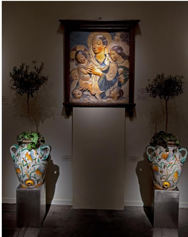
BRAFA 2022 - Dei Bardi Art

We would like to extend our special thanks to our main sponsor, Delen Private Bank , for their support since 2007, and to all our partners.