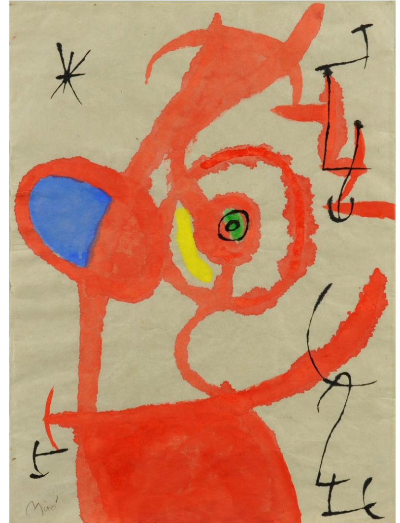
SAMUELIS BAUMGARTE GALERIE Joan Miró (Barcelona 1893-1983 Palma de Mallorca) Untitled VII, 1967