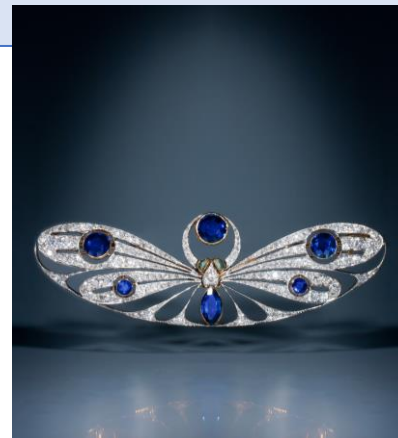
EPOQUE FINE JEWELS Frédéric Boucheron (Paris, 1830-1902) Art Nouveau dragonfly brooch Diamond, sapphire, chrysoberyl, platinum, gold Paris, circa 1900