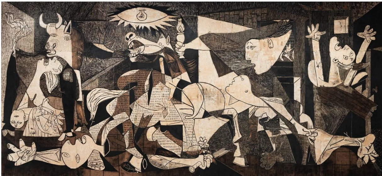
Nosbaum Reding: Damien Deroubaix (Lille, 1972), Garage days re-re-visited , 2019. Engraved wood and ink 243 x 776 x 1 cm. Unique piece

A must-see at BRAFA : Stand 76 of Morentz gallery (NL) which is articulated on either side of a red spiral staircase by Georges Ferran, made for Axe, in polyester foam, steel and lacquer, France, 1971.