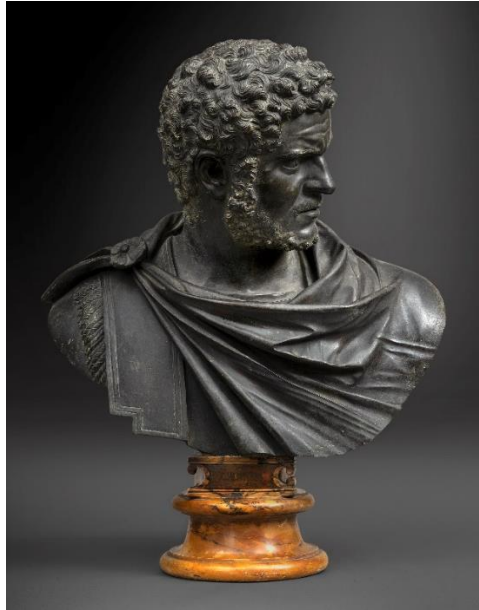
Desmet Gallery: (Att) Luigi Valadier (1726 – 1785), Emperor Caracalla, Rome, last quarter 18th century. Bronze, dark greenish patina on a Giallo di Siena base, H 68 cm

In classical sculpture, Desmet Gallery (BE), located on stand 31, will be exhibiting a beautiful bust by Luigi Valadier whose bronze work is exceptional. As a descendant of a dynasty of goldsmiths, he was a sculptor who was highly appreciated by influential families in Rome. His clients included Pope Pius VI, as well as Archduke Ferdinand of Austria. He also received commissions from churches around the world.