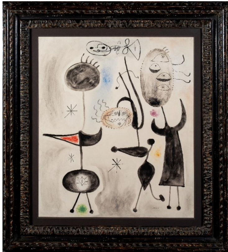
Simon Studer Art SA: Joan Miró (1893-1983), Little Girls Intrigued by the Flight of a Bird Skipping , 1942, 60 x 50 cm