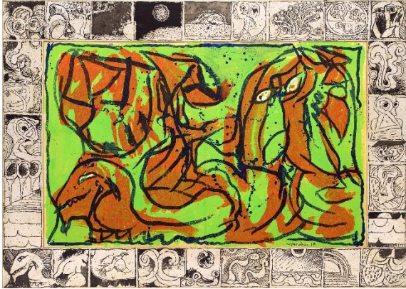
Samuel Vanhoegaerden: Pierre Alechinsky (Brussels, 1927), L'or du rien , 1967-1968. Acrylic on paper mounted on canvas, with a predella in Indian ink, 210 x 295 cm

In terms of Belgian art, stand (110) of Samuel Vanhoegaerden Gallery (BE) will be entirely devoted to one of the major artists of the CoBrA movement, Pierre Alechinsky. Approximately 30 works will be on display, dating from the 1960s to the present day. The centrepiece of the stand, and one of the artist's most important works, is "L'or du rien," which was first presented at the 36th Venice Biennale in 1972. It is the first time in 25 years that a panorama of this size and importance has been presented in a gallery.