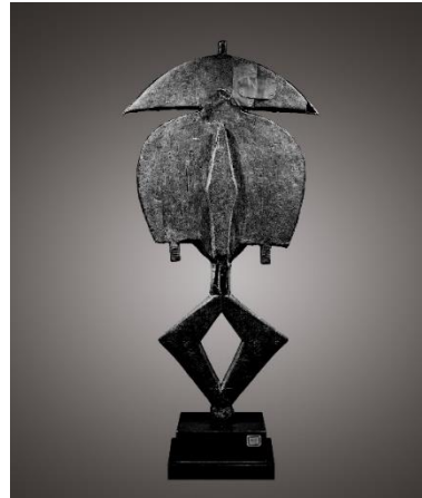
Dalton Somaré: Tutelary figure, Mbulu-Ngulu Kota Obamba, Gabon, 19th century. Wood, copper, brass H 57 cm

Amongst the tribal works on display, visitors will be able to discover a remarkable statuette on the stand 7 of Dalton Somaré (IT). The Milanese gallery will be presenting a perfectly geometrical sculpture. This is an early and classic example of a Kota guardian figure, which distinguishes itself from the corpus of Obamba reliquaries by the precision of its manufacture. The face is a sharp ellipse cut across by two broad bands of brass, which give the figure a severe and dreamy expression. Besides its impeccable pedigree, this sculpture can be considered to be one of the most expressive and purest examples of this style.