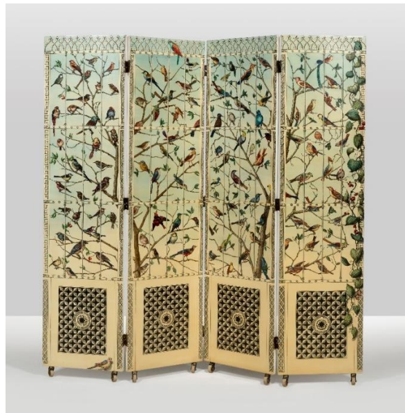
Gokelaere & Robinson: Piero Fornasetti (Italy, 1913-1988), "Uccelli" screen, 1953. Hand-painted wood, brass 207 x 200 x 3 cm