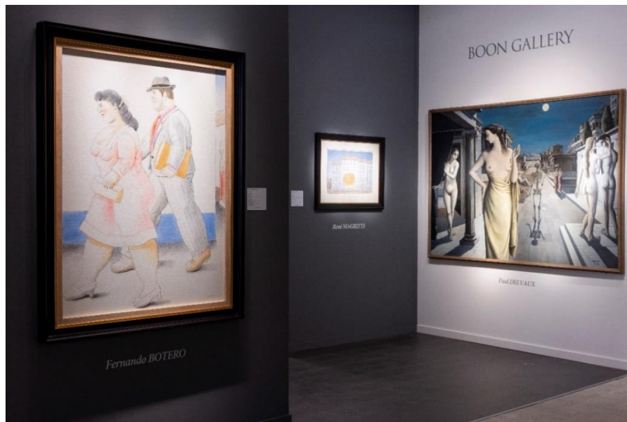
BRAFA 2024 – Stand Boon Gallery

This year's BRAFA will have Surrealist overtones, since it will be celebrating the 30th anniversary of the death of the Belgian painter Paul Delvaux (Belgium, 1897-1994). The Paul Delvaux Foundation will be the guest of honour at this year's Fair, illustrating his artistic career with around fifteen works in a dedicated space. Some thirty works highlighting the recurring themes dear to the artist - women, stations, trains, antique decors and the presence of skeletons - will also be on display on several exhibitors' stands. Boon Gallery (Knokke-stand 26) will be showing a painting entitled La ville lunaire (1944) (and in a completely different vein, a work by the Korean artist Lee Ufan and a superb Jean Dubuffet, not to be missed at the Fair) and Francis Maere Fine Arts (Ghent-stand 40) a work entitled L'été (1963). Galerie Taménaga (Paris-stand 87) will be displaying La tente rouge (1966) and Opera Gallery (Geneva-stand 107) a work from 1968 entitled La fin du voyage .