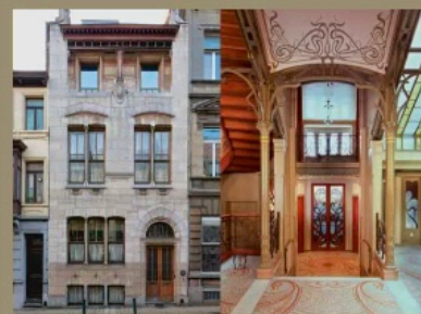
ABOVE The Autrique House (left) and Hôtel Tassel are not to be missed this year.

For information about Art Nouveau Brussels 2023 visit artnouveau.urban.brussels – here you can buy an Art Nouveau pass allowing access to many of the city’s architectural gems as well as discounted rates on tours by Brussels Chatterguides ( bruxellesbavard.be )